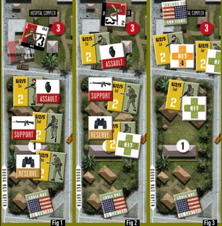
Fig 1: G Company will attack one of the zones of the Hospital Complex. The player assigns the 1st Platoon to be the Assault Platoon, the second Platoon to be the Support Platoon, and the 3rd Platoon to be the Reserve Platoon. As the attacked zone is a victory zone, the player draws two NVA markers from the cup (instead of one for a non-victory zone). He keeps the one with the highest main combat value (3, in this case) and places the other in the cup. All is ready now for resolution of the first round of combat.

HN: The men of the MACV were all experienced soldiers who had been posted to Hue. Therefore they knew the city perfectly. However, if on the one hand they were ready to help, on the other hand their mission in Vietnam wasn't to fight but rather to train South Vietnamese troops. These men were precious and the General Staff did not want to lose them uselessly in the fighting for Hue. Hence the restrictions upon their use.